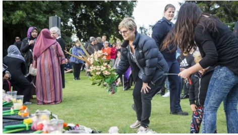
Flowers and candles, a sign of sorrow and love.