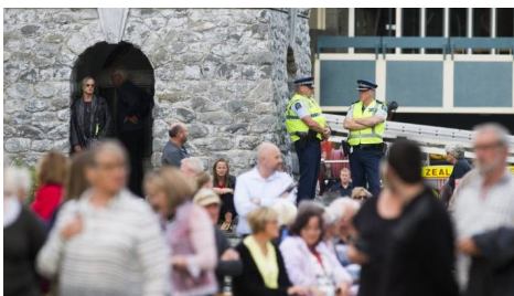
Police at the Seymour Square clock tower during the Blenheim vigil.