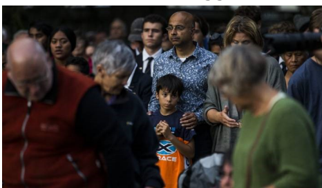
Trying to make sense of the "horror of last Friday" at the Blenheim vigil.