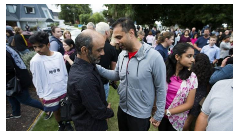
Marlburians show their support for the victims of Friday's Christchurch mosque shootings and their families.

"We are deeply saddened by the tragic events and we strongly condemn the acts of racial hatred and murder.