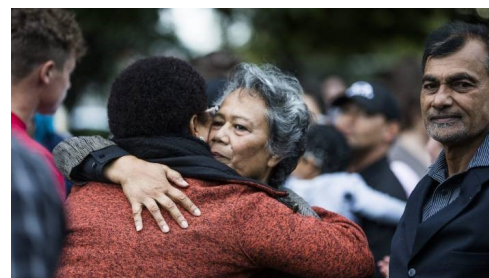
Supporting one another in Blenheim.

not represent the New Zealand that he knew and loved.