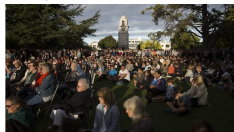
Thousands attend the vigil for Christchurch in Blenheim's Seymour Square.

As New Zealand mourned Friday's terror attacks in Christchurch, official and grassroots vigils were springing up across the country.