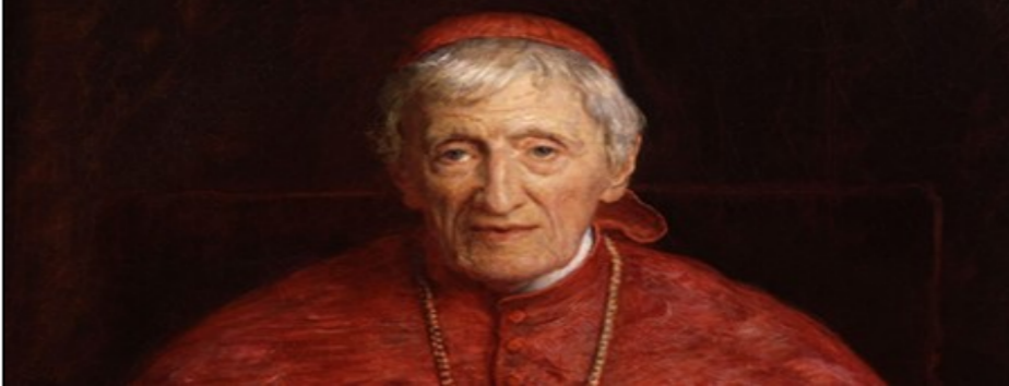
Photo: Cardinal John Henry Newman by Sir John Everett Millais, 1881

His second miracle concerned the healing of a pregnant American woman. The woman prayed for the intercession of Cardinal Newman at the time of a life-threatening diagnosis, and her doctors have been unable to explain how or why she was able to suddenly recover.