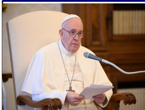
Pope Francis leading his weekly general audience in the library of the Apostolic Palace at the Vatican May 27, 2020. A week later, again at an audience in the library, Pope Francis appealed for an end to racism and violence in the United States.