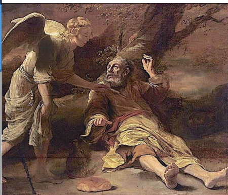
Ferdinand Bol, Elijah fed by an Angel Painted between 1660 and 1663

But the angel of the Lord came back, touched him, and ordered, "Get up and eat, else the journey will be too long for you!"